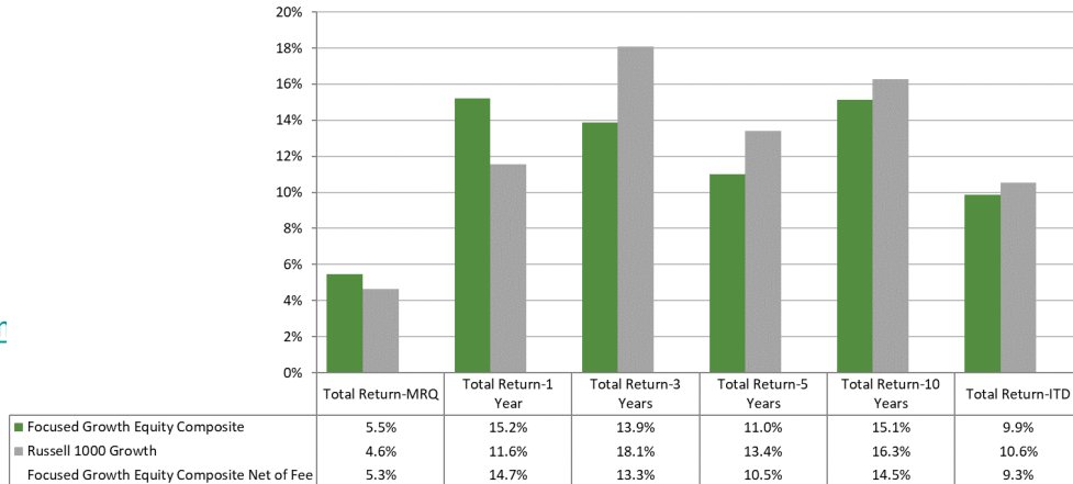
Note: Returns for periods of one year or longer are annualized.